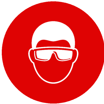
WEAR EYE PROTECTION