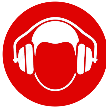
WEAR HEARING PROTECTION