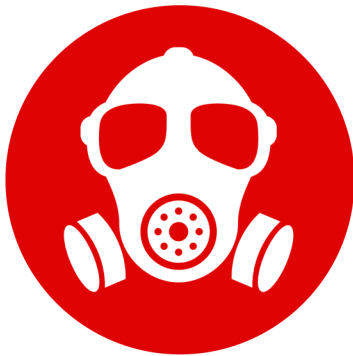
WEAR RESPIRATORY PROTECTION