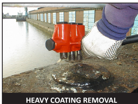
HEAVY COATING REMOVAL